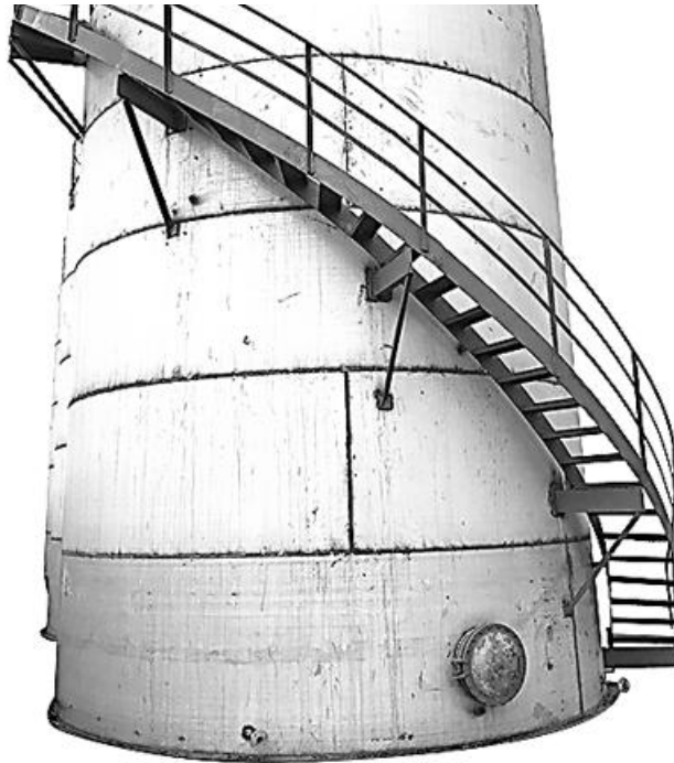
15 kL – FUEL OIL STORAGE TANK